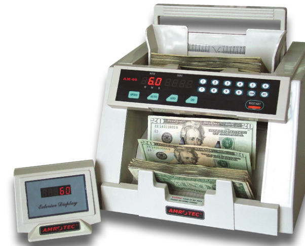
AM-60 IN ACTION

UL LISTED: All Critical Safety components are UL Laboratory listed and tested. FCC and CE certified.