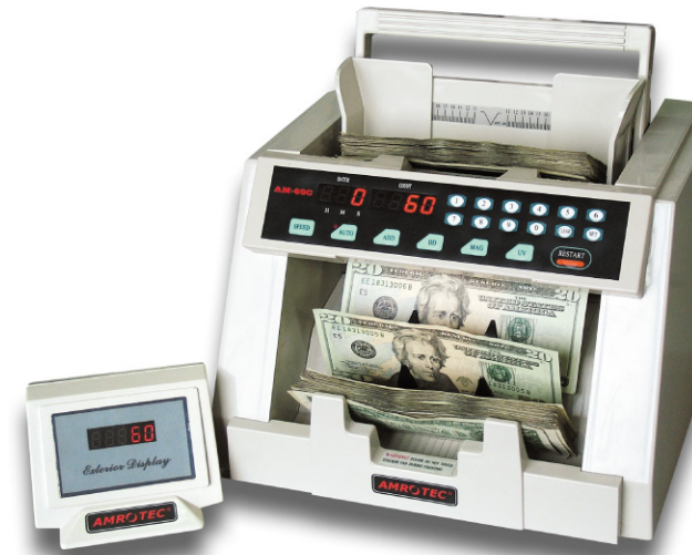
AM-60C IN ACTION

DETECTION: Almost no false alarm in suspect banknote detection with Dual Magnetic Sensors and Special UV