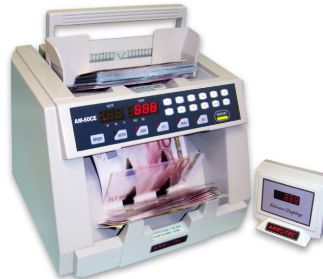
AM-60CE / AM-60CSD IN ACTION

DISCRIMINATING: Using advanced 3D size detection sensors, AM-60CSD model can discriminate banknotes