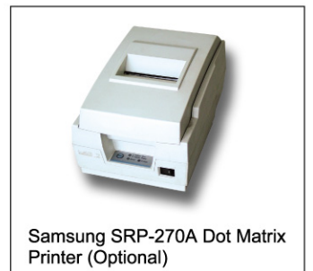
Samsung SRP-270A Dot Matrix Printer (Optional)

*Specifications are subject to change without notice*