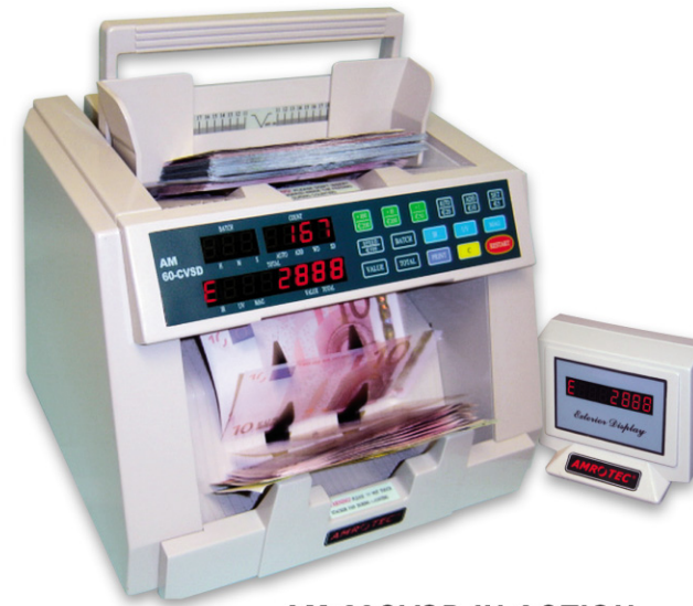
AM-60CVSD IN ACTION

PC INTERFACE: This model can be available with PC connection (optional) to integrate with Bank or Retail Cash Settlement Software.