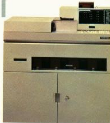
CS-400 In combination with TOSHIBA CASH SORTER CS-400