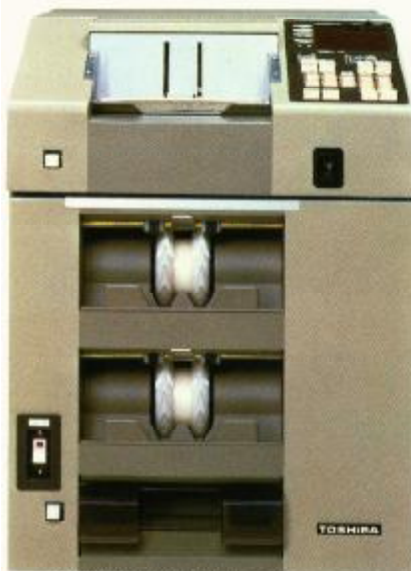
TOSHIBA FITNESS SORTER CF-400