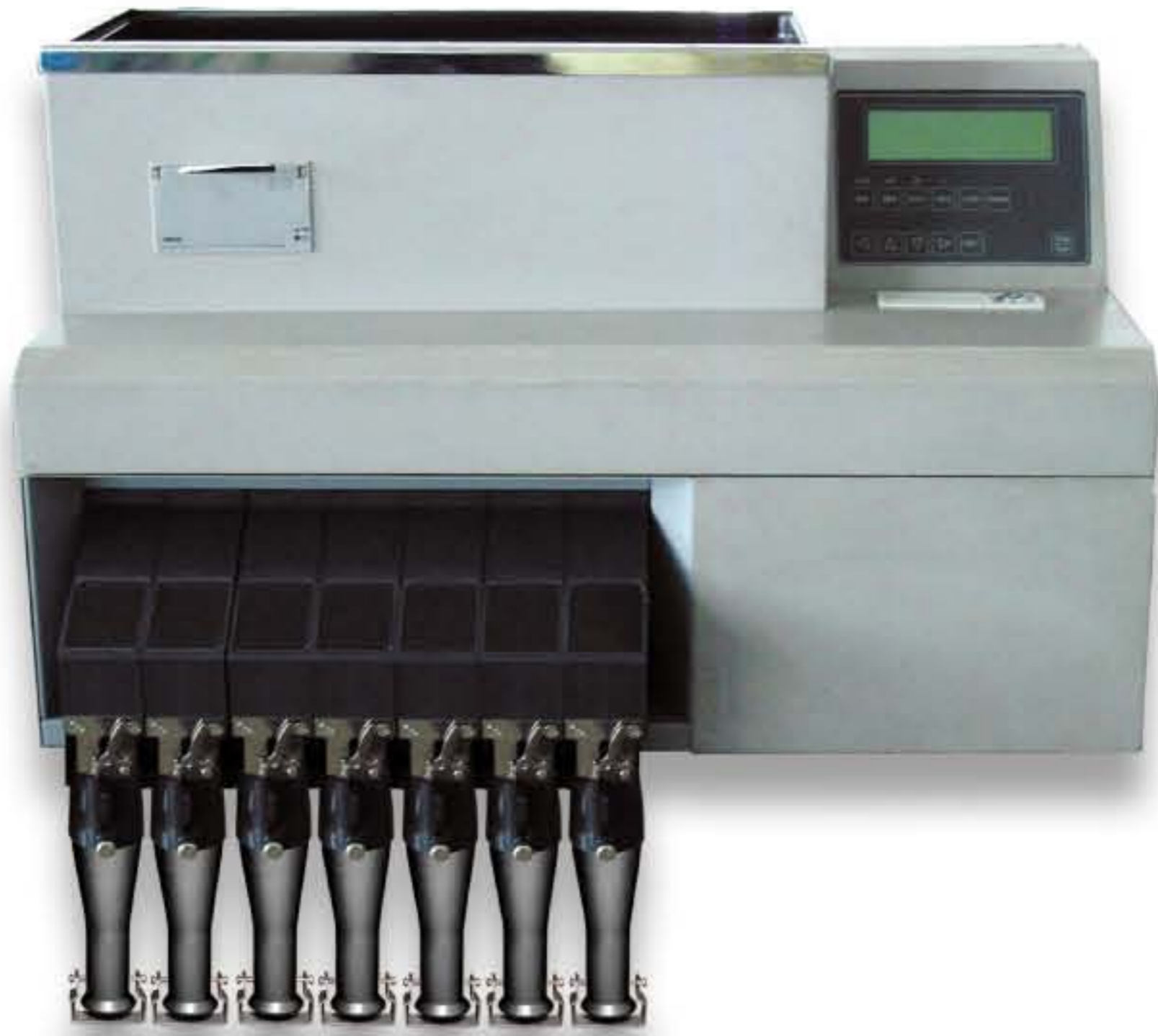
S-500 WITH COIN TUBES FOR ROLLING COINS