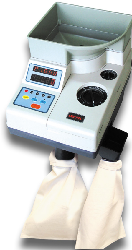
YB-200 IN ACTION

"BEST MEDIUM-DUTY DESKTOP COIN COUNTERS IN THE MARKET"